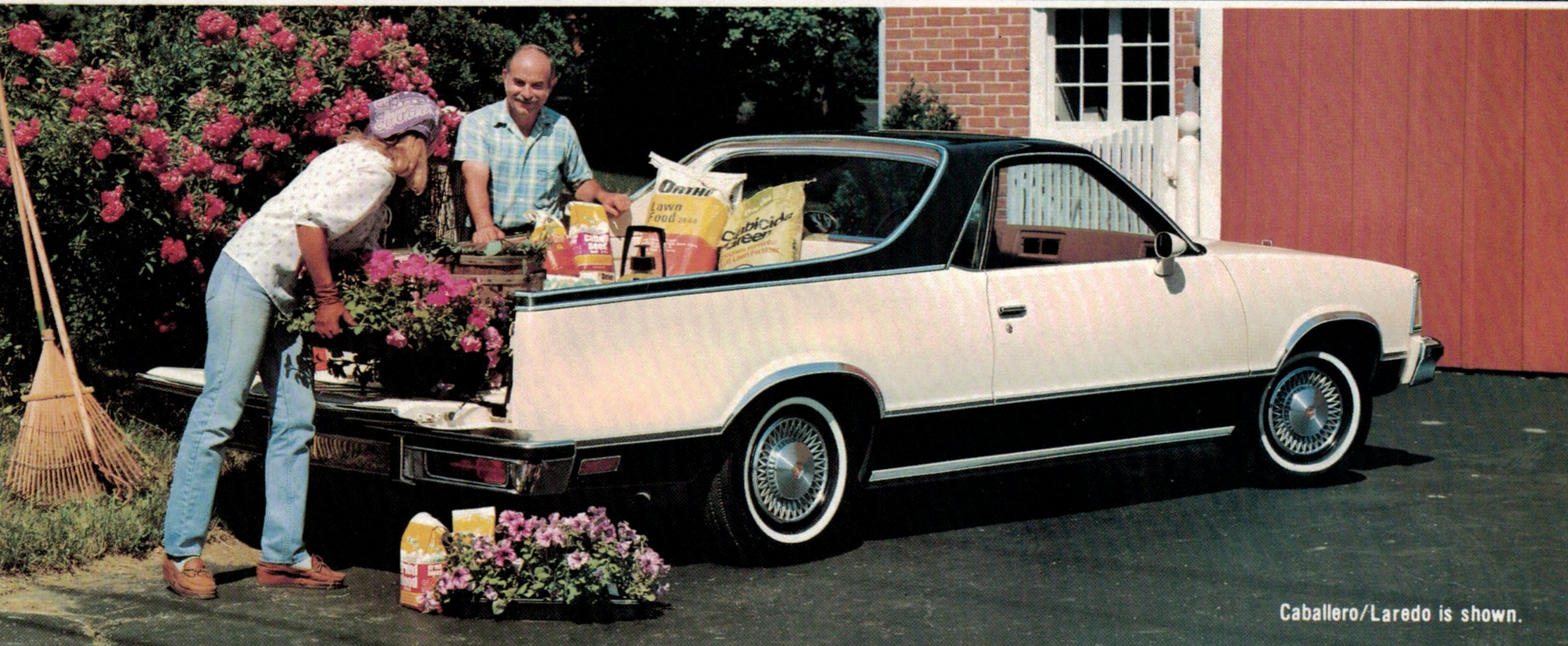
Caballero/Laredo is shown.