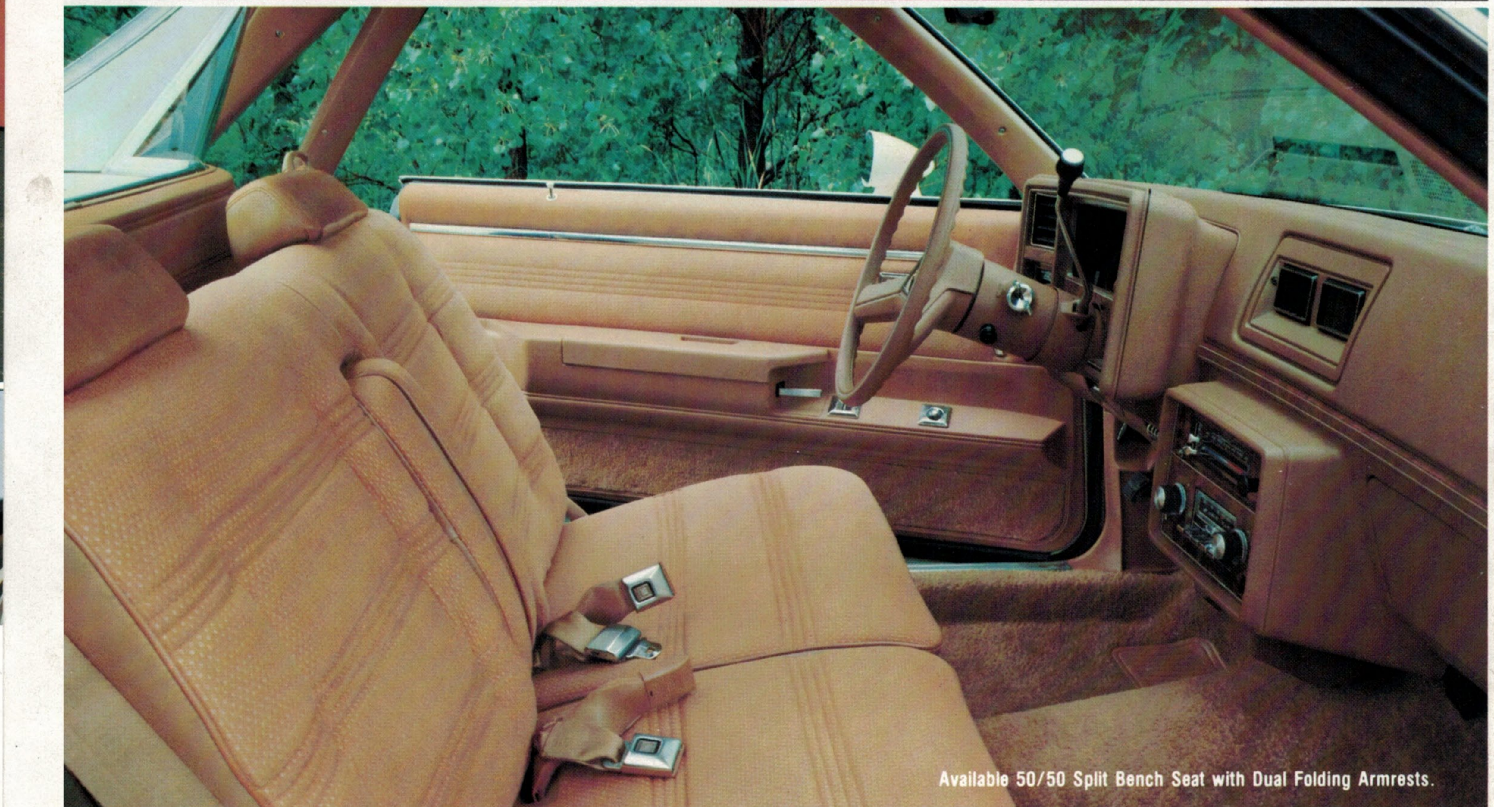
Available 50/50 Split Bench Seat with Dual Folding Armrests.