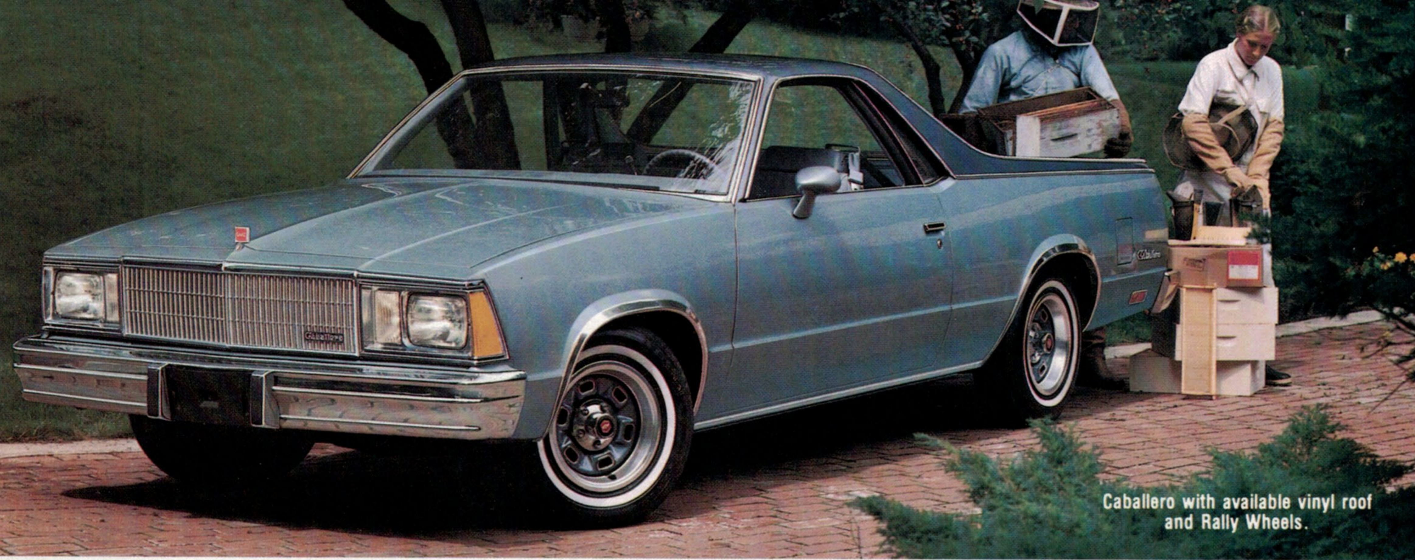
Caballero with available vinyl roof and Rally Wheels.