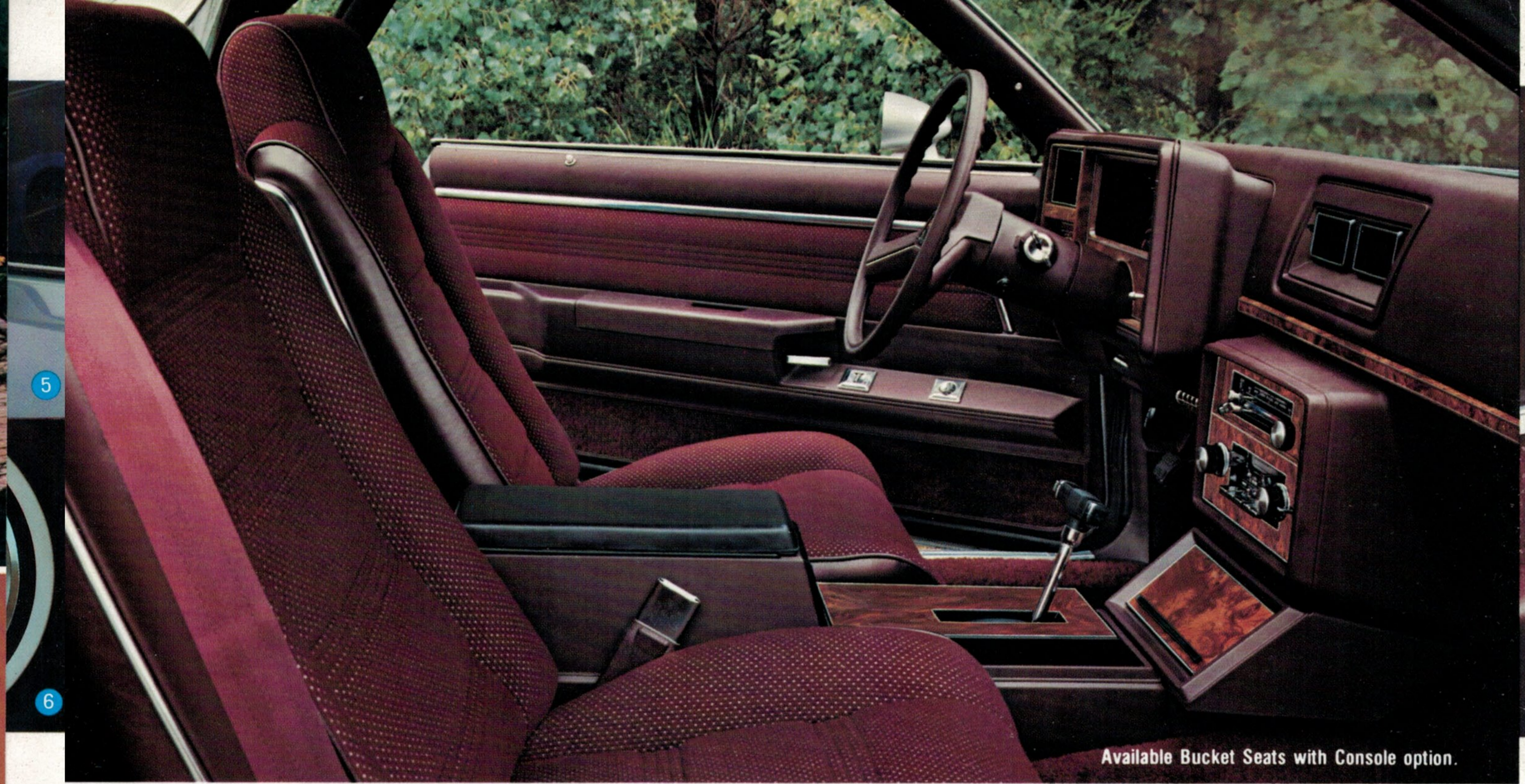
Available Bucket Seats with Console option.